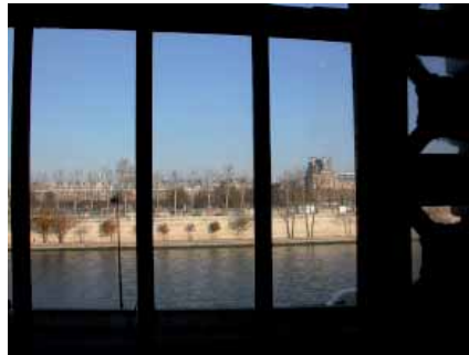
Figure 4: A sequence of compositions. (Musee d'Orsay, Paris)

Sometimes this horizontality is reinforced through vertical elements such as mullions, sometimes it is fractured creating a sequence of compositions challenging the view's quality of wholeness although ironically at the same time contributing to it (Figure 4). Windows, then, can be complicit in presenting our surroundings as a perceptual construct that we label 'landscape' and, as with landscape painting, designed from the view point of a single viewer (Cosgrove & Daniels, 1988).