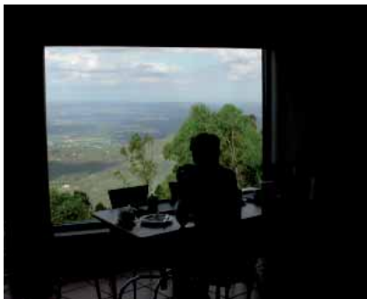
Figure 1: Landscape as a picture; as something viewed. (Picnic Point Lookout, Toowoomba)

In this conception, landscape is understood as a picture; that is, as something viewed (Figure 1). Associated with this then is a notion of landscape as an image. In other words, what is understood is not environmental actuality but rather a representation and an enduring image and experience of landscape quality. In the built environment, windows reinforce this extension of representation in various ways, the most persuasive through the mechanism of framing. Kress & van Leeuwen (1996) in their exploration of the two dimensional image identify the frame as one of the aspects of interactive meaning, in their case referring specifically to the size of the frame and its relation to the human body. While the distance of elements in a landscape from a building is determined by a variety of factors; the size, shape, position and articulation of a window reinforce physical and social distancing. As some designers appreciate, large expanses of glass do not put us more directly in touch with our surroundings, rather they alienate us from them. The smaller the windows and their panes the more intensely windows connect us to what is on the other side (Alexander et al, 1977) (Figure 2).