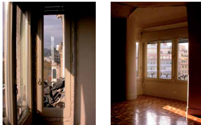
Figure 7: Casement windows with low sill height positioned in alcove with side lights. (Casa Mila, Barcelona)

In design terms, the potential for this type of connection is heightened with windows that can be fully as well as partly opened to the elements such as side hung casement windows; corner windows which dissolve the sharp edge of the building and the single viewpoint of one point perspective; windows and window bays that project beyond the face of the building forming their own alcoves; windows that frame a part of the environment where everyday activities occur; low window sills, deep reveals and window seats (Figure 7); the location of windows where people undertake a range of activities including passage areas (Figure 8); interior windows that interconnect rooms and frame inside activities; portrait shaped windows and so on.