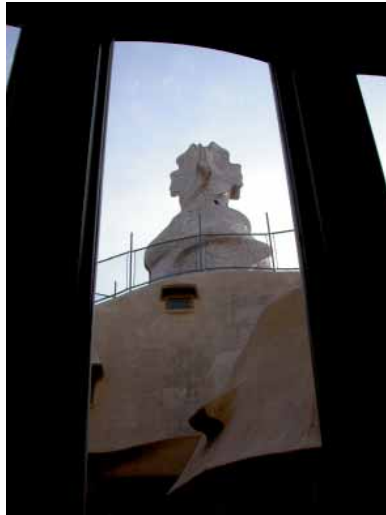
Figure 8: Window in stairway to Casa Mila rooftop.