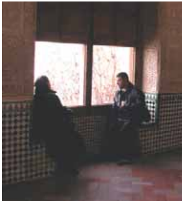
Figure 9: Windows and window seats (The Golden Chamber)

giving it a window seat. Such is the case in the Alhambra in Grenada, Spain. In situations where windows open on to the surrounding hills and mountains, these are generally located in transition spaces, with the main reception and living areas facing inward to landscaped courtyards and gardens. Of particular note is the Mexuar Palace where windows open from The Golden Chamber waiting room to the woodlands beyond. Two seats facing each other are inserted in the window alcove but placed so one's position is tangential to the window opening (Figure 9).