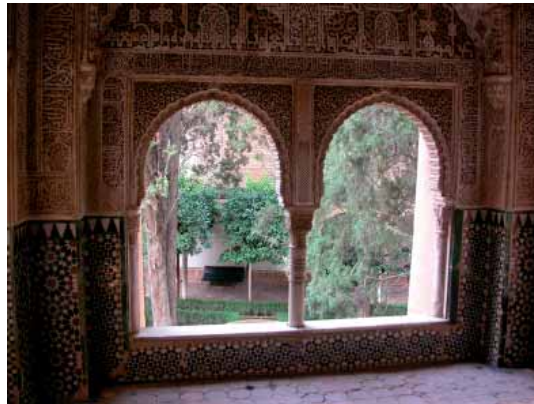
Figure 10: Ornamental openings (The Mirador of Lindaraja)

In this case, the window mullion and other elements are heavily decorated as are many of the surfaces in the various palace interiors of the Alhambra (Figure 10). As their designers realised, ornamentation provides a crucial and very potent means by which one can facilitate transcendence beyond the literal and, in the case of this study, contribute to landscape as an existential phenomenon. Highly ornamented windows and window openings create a unifying seam '...between the elements of buildings and the life in and around them' (Alexander et al 1977, p. 1150). The existential quality is heightened further by the use of pattern, its reiterating rhythms moving one towards infinity; infinity being a metaphor of eternity (Nunez, 2000, p. 72). Central to this is the role played by light, with windows and various window treatments playing a dominant role in its movement from outside to inside, and vice versa.