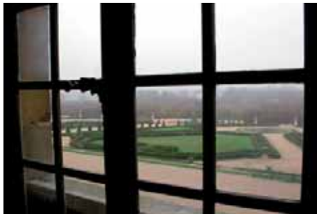
Figure 5: Perpetuating landscape as a political phenomenon. (Versailles)

From an architectural and interior design perspective, one has to question the extent to which windows are complicit in, as Corner puts it, 'concealing the agendas of those who commission and construct the landscape' (p. 158) beyond the building. Sometimes, of course, the agenda is quite overt for example office designs where senior management offices are located at the perimeter of the floor minimising the eidetic potential for the remaining employees in terms of the surrounding environment; or where in reception areas skylines are hijacked to reinforce the firm's social, economic and political status (Figure 6).