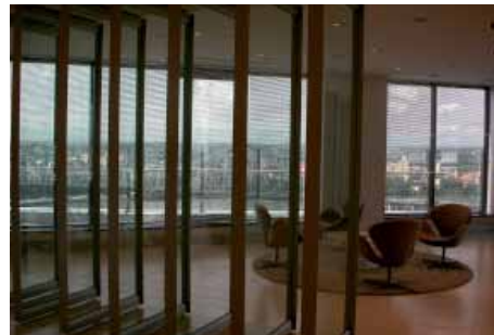
Figure 6: Perpetuating landscape as a political phenomenon. (Solicitors' office, Brisbane)

For Corner, accepting a design role concerned with improving the human condition demands an emphasis of the 'experiential intimacies of engagement and participation' and a situation where 'performance and event assume conceptual precedence over appearance and sign', where 'the emphasis shifts from object appearance to processes of formation, dynamics of occupancy, and the poetics of becoming' (p. 159).