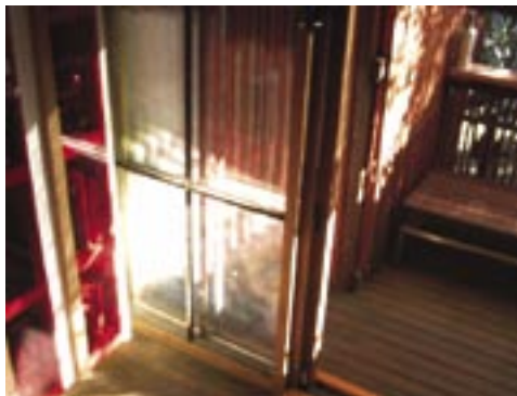
Figure 7: Edges, materials, protrusions, 2004.

Willis, D. (1999). The Emerald City And Other Essays on the Architectural Imagination . New York: Princeton Architectural Press.