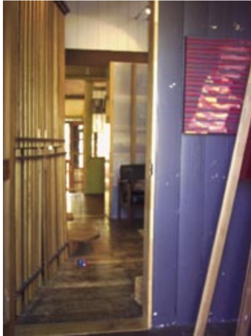
Figure 4: Views inside-out, 2004.