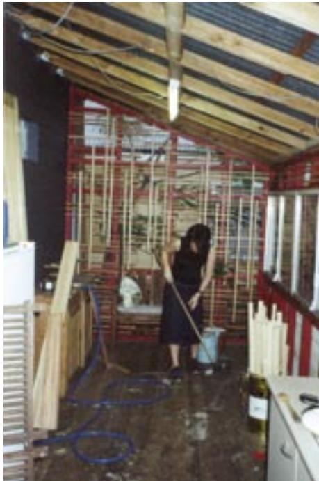
Figure 3: Maintenance or building work? 2002