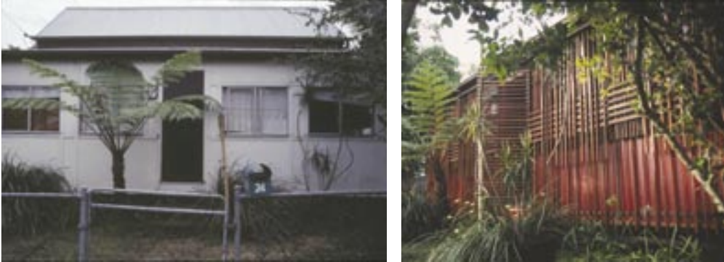
Figure 1: Before and after external images of Avebury St, 2001. (Photography: Matthew Dixon, project collaborator)

and, most importantly, the design process. Projects such as Avebury St can help us ‘rethink’ the interior as a blurring of physical and conceptual boundaries of space: Irigaray’s ‘volume without contour’ (Grosz, 2001, p. 165).