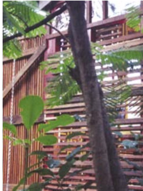
Figure 6: Edge space, 2003.