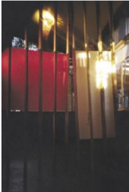
Figure 5: Screen installation, 2004.