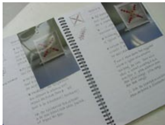
Figure 2: Reflective journal (Carolyne Jackson).

Colour is no longer a secondary element that supports shape, it is now form & the vessel for transcendental meaning; [The work] was an art of spatial illusion; [It] creates figure-ground relationships; The colour floats in shallow depth over the colour field; and, He achieves this through adjusting colour values and its extent (Powerpoint presentation, 2002).