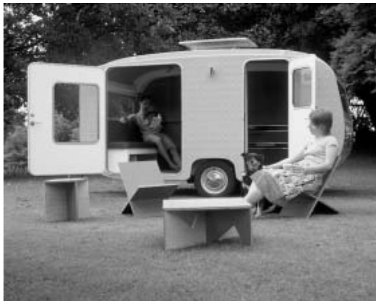
Figure 1: Exterior Katy Wallace Caravan Project (2003)

The introduction of a solid side to the caravan helped redefine the spatial schematic of the project. In implementing her changes, Wallace adopted a bay structure in the caravan scheme. This was drawn from the very location that the caravan might eventually find it self. As Wallace put it 'there is always one view on a holiday you don't want' (Lloyd-Jenkins & Wallace, 2003). The bay, or cove form, provides dwellers with both protection and a clear point of approach or welcome. It is a typology suited to the caravan. The protecting wall