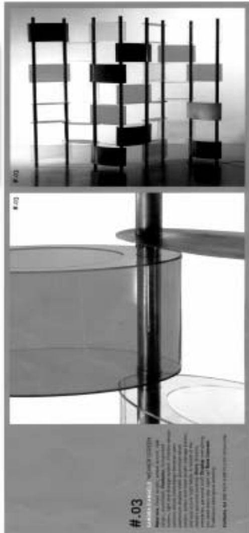
Figure 5: By invitation 'Weaver Screen' (illustrated) was on exhibition at the Australian Craft Council 'Object Gallery' in Sydney in 2001.

L. O'Farrell, Michael, James Pike: Desert Designs 1981-1998, Art Gallery of WA, Perth, 1998, p.14