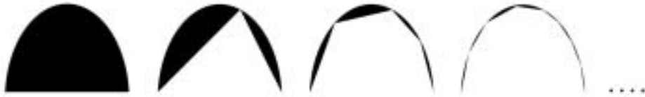
Figure 2: Archimedes parabola (Adaptation: Author from Seife, 2000)

Michaelangelo was well aware of the infinite potential of the void. In his fresco, 'The Creation of Adam', the significance of the work lies not in the rendition of the figures but in the tiny space contained between the languid fingers of God and man. All of infinity is condensed into this measurable space where Michaelangelo often found his inspiration. When questioned about his sculpting process for example, he allegedly replied that when carving a horse he simply cut away the pieces of stone that were not a horse. Supporting evidence for this statement lies in the images of his incomplete work, where intact figures appear as found form in the incarcerating stone.