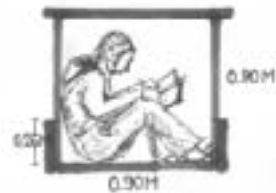
Figure 3: Student sketch showing room plan and elevation