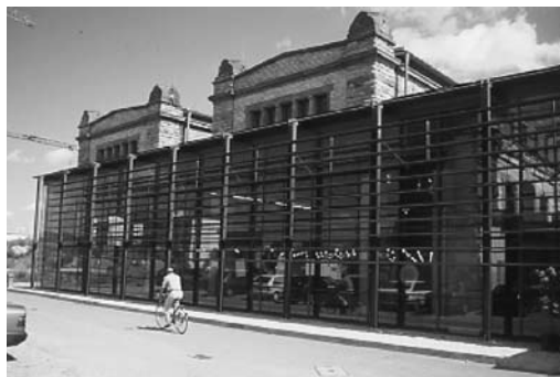
Figure 4: Landau Library front façade and halls.