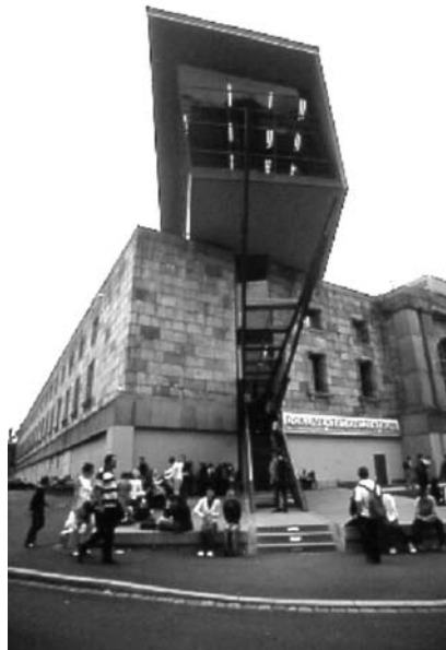
Figure 1: View from exterior as the shard emerges to form the new entrance.

I used oblique lines against the existing symmetry and its ideological significance. To contrast the heaviness of the concrete, brick and granite I turned to lighter materials: glass, steel and aluminium. The historic walls are left in their original state without ever being touched by the new work (Domenig, 2002, p. 28).