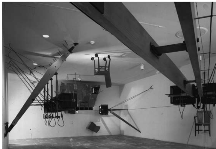
Figure 5: Para-site exhibition at the Museum of Modern Art, New York, 1989.

Diller and Scofidio suggest that the museum, in this case MoMA, is of an era which is defined by the supremacy of sight. All sorts of complex encoded constructs govern looking, in all of its complexities. Para-site is a reading of this situation. The strategically positioned cameras relay their views back to a series of monitors deployed throughout the museum galleries. The four revolving doors are fed into the first floor gallery where they are displayed on four monitors held by a timber and steel armature, a move that reinforces its invasive qualities (Figure 5). A chair is fixed to the skeleton that invites viewers to sit and monitor the other areas of the museum. The seat is embossed with a raised text that as the sitter stands up to leave is imprinted onto their rear, another invasive tactic.