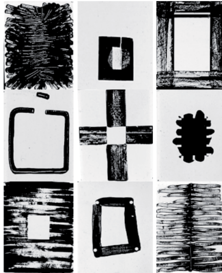
Figure 2. INOUT diagrams.

phenomena of things in a curious mix of acceptance and doubt of scientific fact. All that he witnesses seems to contradict what he has learned. Somewhere within his uncertainty he accepts that conditions are relative and relational along a shifting continuum of time and material: