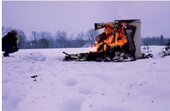
Figure 5. Burn site.

gasped. The heat drew dark distraught figures on the white museum-like surfaces. The room harboured by the willow trees and a low bank of grey clouds glowed and crackled violently when the flames penetrated through the volatile layers of sawdust, wax and whiskey. Four hours later the room lay in an exhausted heap of homogenous ashes, just waiting for the next gust of wind to enhance their spatiality and extend their life.