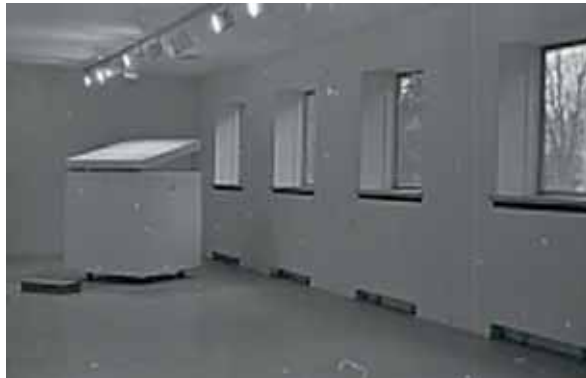
Figure 4. Gallery installation.

A fairly astute critique if only the notion of oppositions was intended to structure the making of the room. One needed to go inside the room rather than rely on an external reading of the object.