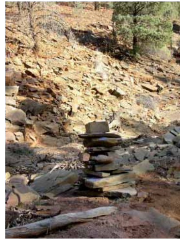
Figures 4 & 5: Desert, landscape intervention, June 2004, Australia.

The ability of water to define and construct landscape is significant. Spirn (1998) speaks of the language of the landscape, the structures and the stories. This is a language that evolves over time and water (like wind) is essential in its formation. She writes, 'Water flowing, like sun shining, shapes and structures landscape' (p. 88). In surveying this landscape, the creek beds were existing thoroughfares or paths across the landscape. Their role in creating the grander landscape narrative seemed to be the most appropriate site for the installation and my exploration into creative practice and location. This time the installation was a marked path along a creek bed. The objective here was particularly to explore the act of 'noticing' (Mason 2002) as a tool for engagement with space and subsequently create a sense of location. This was one of the key themes to emerge from the participants from Forest , people noticed things and became aware and engaged with them. This was true of their practice, they felt that they noticed and engaged with people, places and things and drew on them in their own creative work.