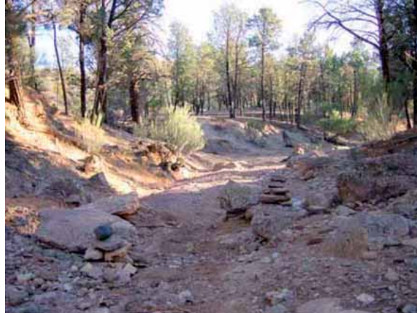
Figure 3: Desert, landscape intervention, June 2004, Australia.

Desert was the second installation of the project.