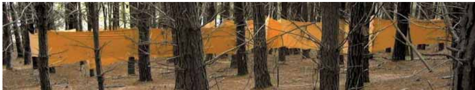
Figure 2: Forest, cloth installation, September 2003, Australia.

... travellers who, finding themselves lost in a forest, ought not to wander this way and that, or, what is worse remain in one place, but ought always to walk as straight a line as they can in one direction and not change course for feeble reason, even if at the outset it was perhaps only chance that made them choose it; for by this means, if they are not going where they wish, they will finally arrive at least somewhere where they will be better off than in the middle of the forest (Descartes, in Harrison 1992, p. 110).