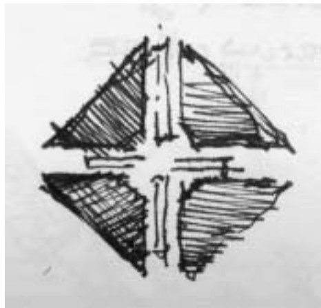
Figure 2: Cladding sketch plan