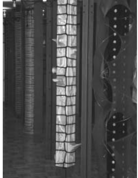
Figure 3: Column cladding photo