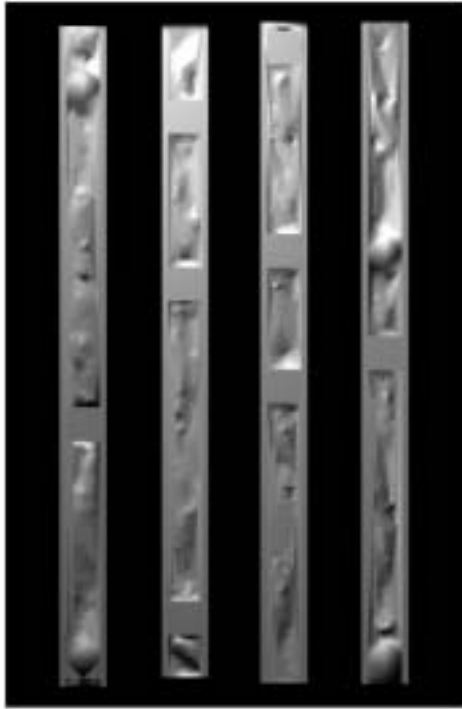
Figure 1: Carved virtual model