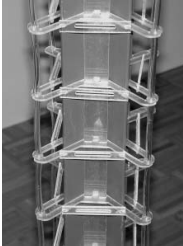
Figure 8: Scaffold