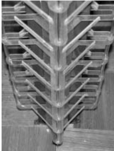
Figure 5: Small acrylic parts