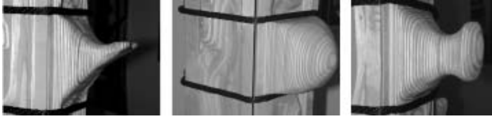
Figure 4: Protrusion details

ornament in the Art Nouveau movement was based on floral and other organic forms, it consciously veered away from ornament as imitation. Contemporary materials and processes were used to translate botanical forms into patterns that respond to functional and structural requirements' (Dineva & Kessler, 2001).